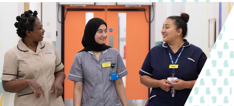
STR 1 – Oral Medicine